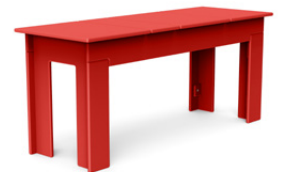
apple red: LC-LB-AR