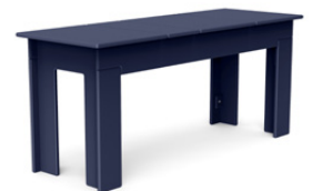
navy blue: LC-LB-NB