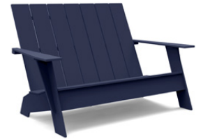
navy blue: AD-A2SC-NB